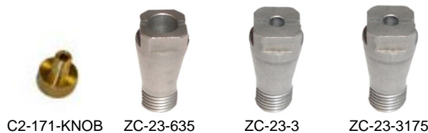
C2-171-KNOB ZC-23-635 ZC-23-3 ZC-23-3175