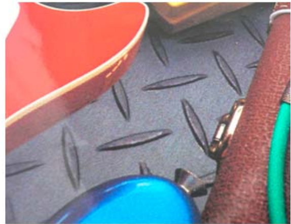
With Light Ink Control