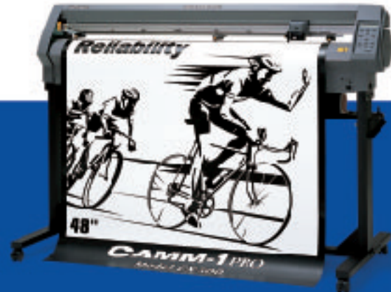
CAMM-1 PRO Model CX-500 Usable media width: 3-1/2 - 54" (90 - 1,372 mm) Maximum cutting width: 47" (1,195 mm)