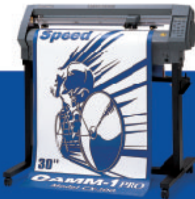
CAMM-1 PRO Model CX-300 Usable media width: 2-36" (50 - 915 mm) Maximum cutting width: 29" (737 mm)