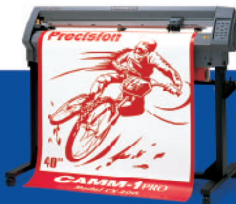
CAMM-1 PRO Model CX-400 Usable media width: 3-1/2 - 46" (90 - 1,178 mm) Maximum cutting width: 39" (1,000 mm)