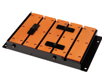
Roland's optional T-Slot makes it easy to secure objects of different sizes for precision engraving. Part number: ZIT-35