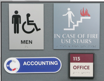
Indoor & ADA Signage