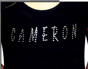
Custom Rhinestone Apparel