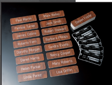
Metal, Plastic or Brass Nameplates