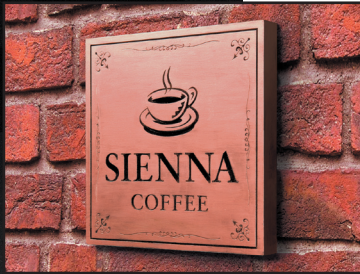
Elegant Outdoor Signs