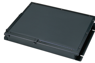
Roland's optional Vacuum Table keeps engraving material in place, eliminating the need for adhesive sheets. Part number: ZV-23A