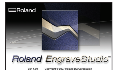
Bundled Roland EngraveStudio software gives you the power to create whatever your customers need!

Roland reserves the right to make changes in specifications, materials or accessories without notice. Your actual output may vary. For optimum output quality, periodic maintenance to critical components may be required. Please contact your Roland dealer for details. No guarantee or warranty is implied other than expressly stated. Roland shall not be liable for any incidental or consequential damages, whether foreseeable or not, caused by defects in such products. All trademarks are the property of their respective owners.