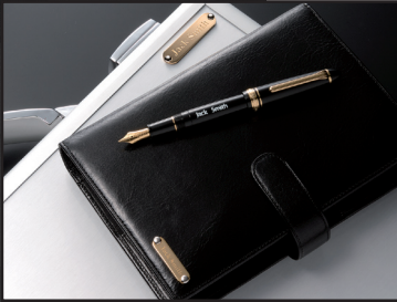
First-Class Personalized Gift Items