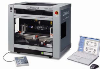
Computer not included

The New Roland EGX-360 Gift Engraver MSRP: $17,995.00