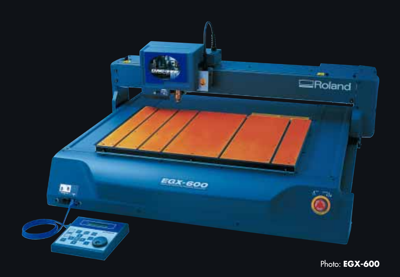
Software : Dr.Engrave