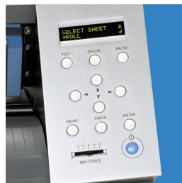
Large, ergonomically angled, backlit LCD control panel is easy to see while loading media.

(3) According to Roland measurement criteria: • Using the included software from Roland. • Using a laser or ink-jet printer having a resolution of 720dpi or better. • Excluding glossy or laminated material. • Excluding effects of printing distortion due to printer precision and effects of material expansion, contraction, or warping. Depending on the ink (black) employed by the printer used, correct sensing may not be possible.