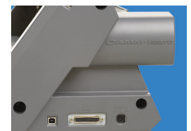
Digital servomotor technology ensures the cutter's maximum accuracy and cutting speeds up to 20-inches per second. Easy access USB and serial ports make connectivity a snap.

Roland reserves the right to make changes in specifications, materials or accessories without notice. Your actual output may vary. For optimum output quality, periodic maintenance to critical components may be required. Please contact your Roland dealer for details. No guarantee or warranty is implied other than expressly stated. Roland shall not be liable for any incidental or consequential damages, whether foreseeable or not, caused by defects in such products. All trademarks are the property of their respective owners.