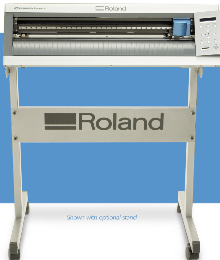
Shown with optional stand

Cut intricate vehicle graphics with precision and speed.