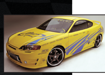
Create professional vehicle graphics that turn heads.