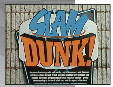
Produce durable, eyecatching outdoor signage.