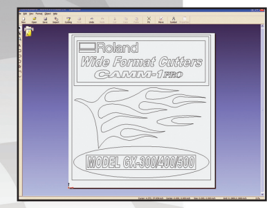
Re-size, re-position, rotate and mirror graphics for precision cutting. Roland CutStudio™ makes it easy!

Speed. Power. Precision. The Roland GX Pro lets you shift your graphics business into high gear. Powered by digital servomotors, these professional grade vinyl cutters achieve maximum accuracy and cutting speeds up to 33 inches per second with up to 350 grams of pressure. Vinyl vehicle graphics, window tint, signage, labels, stencils and even pinstriping come out crisp and clean.