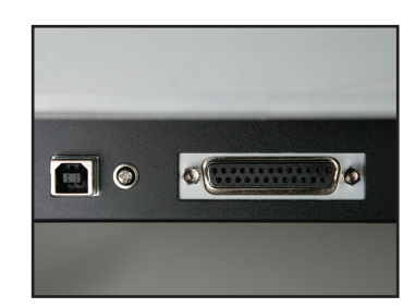
Easy access USB and serial ports make connectivity a snap.