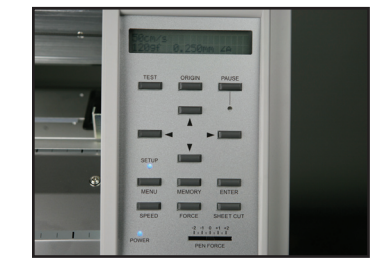
Convenient front panel makes it easy to adjust blade force, cutting speed and origin point. It also stores cutting conditions for up to eight pre-set jobs.

Roland reserves the right to make changes in specifications, materials or accessories without notice. Your actual output may vary. For optimum output quality, periodic maintenance to critical components may be required. Please contact your Roland dealer for details. No guarantee or warranty is implied other than expressly stated. Roland shall not be liable for any incidental or consequential damages, whether foreseeable or not, caused by defects in such products. All trademarks are the property of their respective owners.