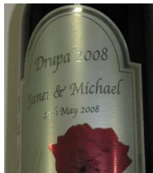
Custom label with spot varnish

Clear ink can be used as a high-gloss area highlighter (spot varnish) for premium labels and packaging applications or simply to provide glossy finish to the entire image. VersaWorks also provides an easy-to-use special effects print mode for printing multiple layers of clear coat for realistic textured effects and specialty applications such as crocodile skin, doming and even Braille.