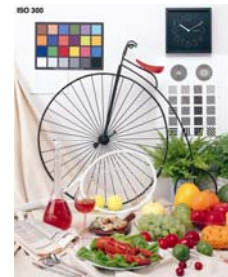
Reference image for running cost calculation: ISO N5A.TIF