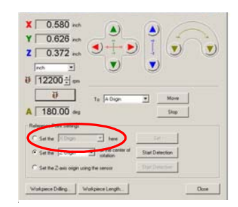
Virtual Control Panel