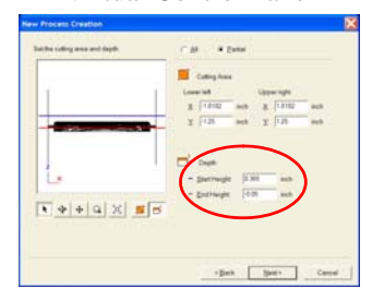
Modify "Start Height"