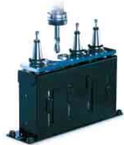
The MDX-650 with ATC automatically changes tools by specifying the tool's stock number from the included CAM software.