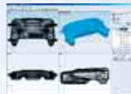
MODELA Player 4

MODELA Player 4 is a CAM software application that accepts IGES, DXF* and STL files exported from most popular industrial 3D CAD software programs. It is used to generate proportional 3D scaling, identify milling direction and to automatically generate and display the tool path. MODELA Player 4 supports tool changing when used with the Automatic Tool Changer (ATC) and automatic side cutting when used with the Rotary Axis Unit. It can also be used for 3D engraving. *3D DXF compatible with AutoCAD® R12