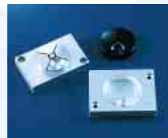
Male and female molds milled from aluminum