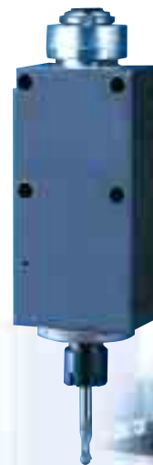
High Precision Spindle ZS-650TY

A high-precision ATC spindle is included with the ATC, negating the need to purchase any additional spindles.