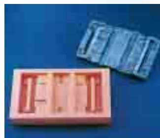
A poured plastic part produced from a mold milled in SRP Tooling Board.