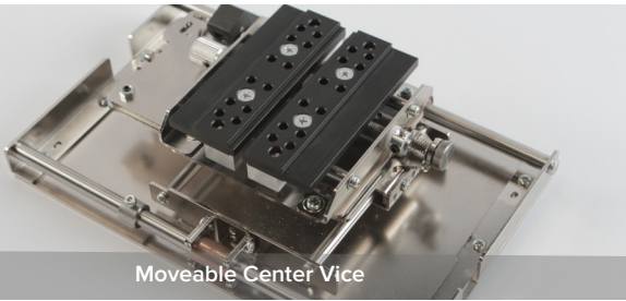
Moveable Center Vice