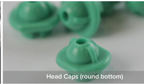
Head Caps (round bottom)