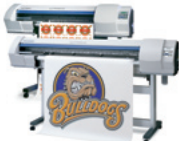
VERSACAMM™ SP SERIES SP-300V $11,595 US SP-540V $17,895 US