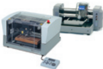
EGX DESKTOP ENGRAVERS STARTING AT $2,595 US EGX-20 & EGX-350 SHOWN HERE