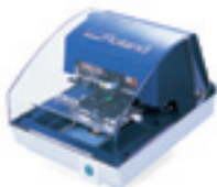
METAZA IMPACT PRINTER MPX-80 $3,695 US