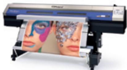
SOLJET™ PRO III XC-540 $31,495 US