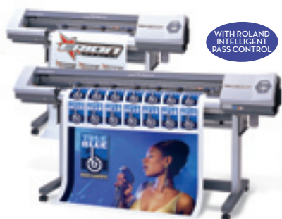
VERSACAMM™ VP SERIES VP-300 $15,795 US VP-540 $21,995 US