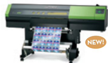
VersaUV LEC-300 LEC-300 $52,495 US