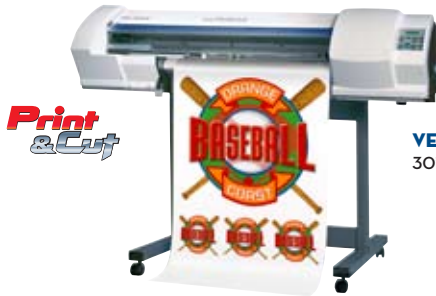
VERSACAMM SP-300V 30" PRINTER/CUTTER