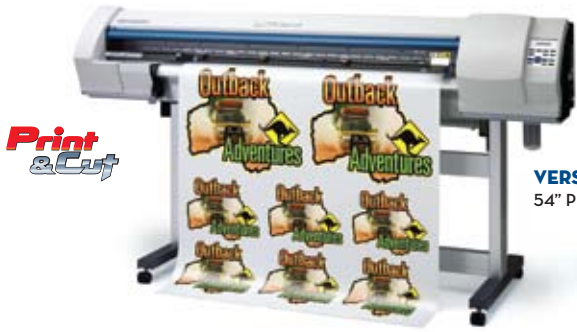
VERSACAMM SP-540V 54" PRINTER/CUTTER