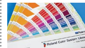
Roland Color swatch books

own media using your own Roland device. These reference tools can be reviewed with your customer to choose the desired spot color in advance. Once you and your customer agree on the desired spot color, you can then print that color with 100 percent accuracy using your Roland inkjet.