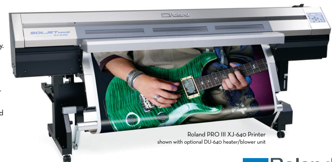
Roland PRO III XJ-640 Printer shown with optional DU-640 heater/blower unit

Roland has done the ground work for you. Roland eco-solvent inkjets come complete with VersaWorks™, a powerful RIP software packed with features for the ultimate in color management, ease-of-use and productivity, and are supported by a comprehensive line of ink and media options that have been tested, profiled and certified for optimum performance with Roland products. ■