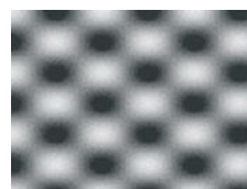
Closeup of the precision ink firing pattern

This revolutionary patent-pending technology also increases productivity by optimizing print quality at high speeds.* In fact, Roland Intelligent Pass Control has doubled productivity in Standard print mode on vinyl on the XC-540.