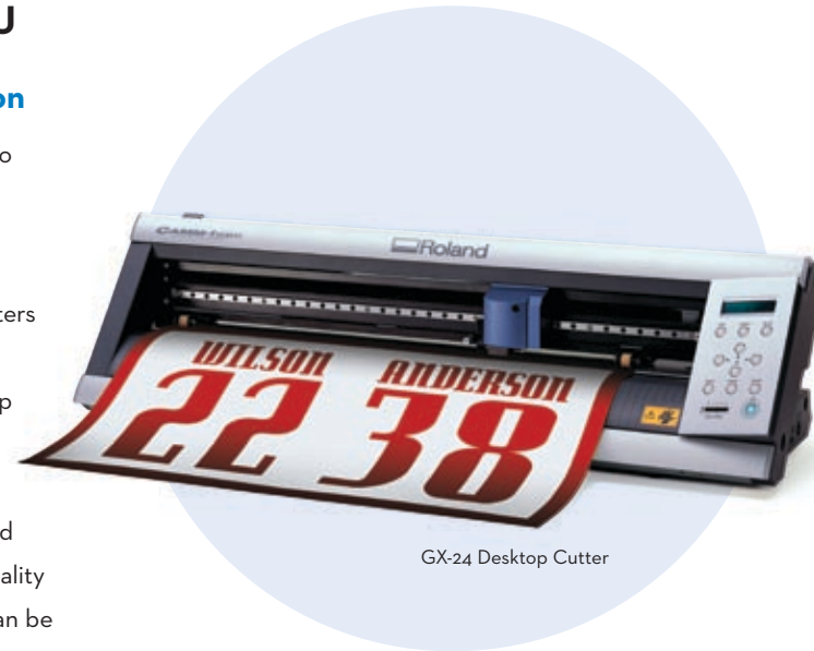
GX-24 Desktop Cutter

Due to their exceptional reliability and value, Roland CAMM-1 vinyl cutters have for many years been the tool of choice for sign shops, apparel decorators, and educational institutions worldwide. The GX-24 desktop vinyl cutter adds optical alignment to allow printed graphics to be automatically aligned and accurately contour cut. Included CutStudio™ software lets users enlarge, reduce, re-position, rotate and mirror images. With the TechSoft GX-24 Education Kit, commercial quality color-printed packaging, paper and vinyl labels, iron-on decals, etc., can be created with ease.