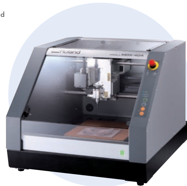
MDX-40A Desktop Milling Machine

Easy-to-use CAM and simulation software is included. The ability to use G-code allows educators greater flexibility and ease of integration with sophisticated design programs, including Mastercam, EdgeCAM, SurfCAM and Gibbs CAM. Optional accessories include a rotary 4th axis for unattended 360 degree milling and a 3D scanning attachment for reverse engineering.