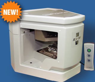
RX-50 - $9,995 us