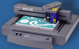
EGX-30 - $2,995 us