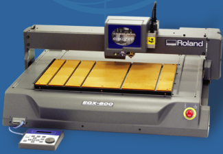
EGX PRO 400 - $9,995 us EGX PRO 600 - $11,995 us