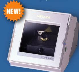
MPX-60 - $2,495 us Prices subject to change.