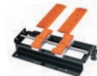
Center Vise holds objects up to 5.9" (X) x 5.8" (Y) x 1.3" (Z).