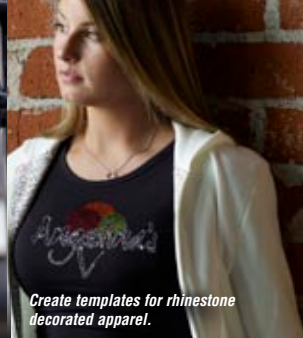
Create templates for rhinestone decorated apparel.