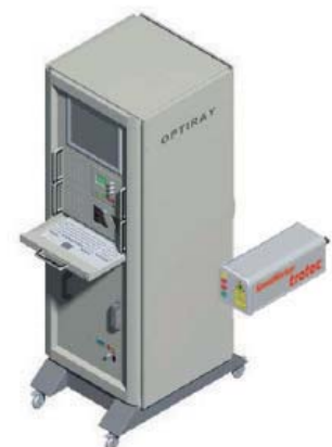
OEM package II system integration including exhaust unit

Lilienthalallee 7, 80807 München Tel. +49 (0) 89 / 322 99 00, Fax. +49 (0) 89 / 322 99 077 trotec@trotec.net www.trotec.net