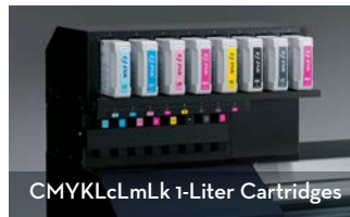
CMYKcLmLk 1-Liter Cartridges