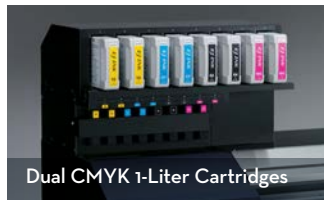
Dual CMYK 1-Liter Cartridges

The EJ runs optimally with Roland DG EJ inks in 4-color or 7-colors and high-capacity 1-liter cartridges. The result? High-volume printing and bold, exciting colors at costs up to 35% lower than the competition.