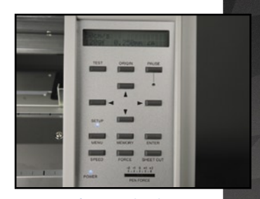
Convenient front panel makes it easy to adjust blade force, cutting speed and origin point. It also stores cutting conditions for up to eight pre-set jobs.