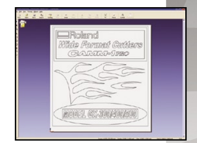
Re-size, re-position, rotate and mirror graphics for precision cutting. Roland CutStudio™ makes it easy!

Roland reserves the right to make changes in specifications, materials or accessories without notice. Your actual output may vary. For optimum output quality, periodic maintenance to critical components may be required. Please contact your Roland dealer for details. No guarantee or warranty is implied other than expressly stated. Roland shall not be liable for any incidental or consequential damages, whether foreseeable or not, caused by defects in such products. All trademarks are the property of their respective owners.