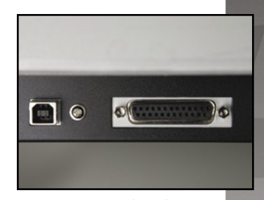
Easy access USB and serial ports make connectivity a snap.